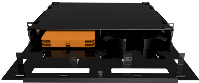
Enclosures are sold empty, front view.